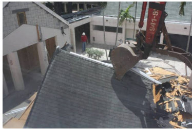
Left - The destruction begins on the roof of the Pavilion. If your class was on the south side of the building, you got to see and hear the excitement.

You have seen and enjoyed the first stage of our major campus update, the Youth Center/Gymnasium. Now St. Mark's Episcopal School is starting on Phase 2, and it will be even bigger and better. Last month the construction company began the destruction part of this phase. We all watched as the walls (and roofs) of the Parish Hall and the Pavilion came down. It was quite a sight. The new plan, which will take about a year, is to raze and rebuild the administration offices and to expand the church. My next update should show some great building progress.