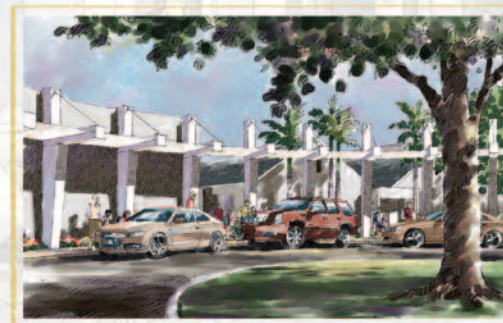
The east side of St. Mark's Hall includes a circular, covered drop-off area that will provide sheltered access to all the main campus buildings.

Sid and Annette urge their fellow parishioners to contribute to the extent that they are able. "The current campaign to update and renovate the St. Mark's campus is enormously important," Sid says.